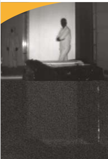
Top: covert illumination Bottom: visual