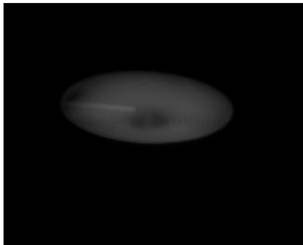
Glass ceramic cooking plate imaged with XEVA InGaAs camera

Picking out defective glass products the hot end of the process, while the temperature is still above 200°C, is particularly interesting for glass manufacturers. At that stage, rejects are identified, then shunted aside and reprocessed efficiently, greatly reducing scrap. Unlike thermal cameras, short SWIR cameras can image through glass, allowing operators to inspect both the interior and exterior walls of the bottle, as well as monitor the temperature uniformity and cooling rate of the material.