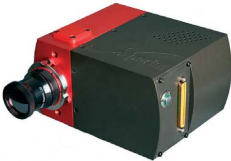
Spectral Camera LWIR with uncooled detector

SPECIM presents its thermal hyperspectral cameras in the LWIR region 8 to 14 \mu\text{m} . Three camera models have been specially designed to meet diverse requirements in industrial, research and security applications.