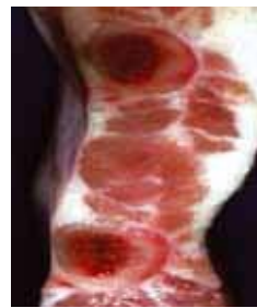
Pork meat analysis