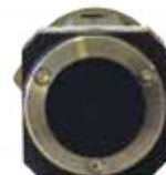
ImSpector UV4E spectrograph, front view