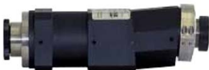
ImSpector UV4E spectrograph, side view